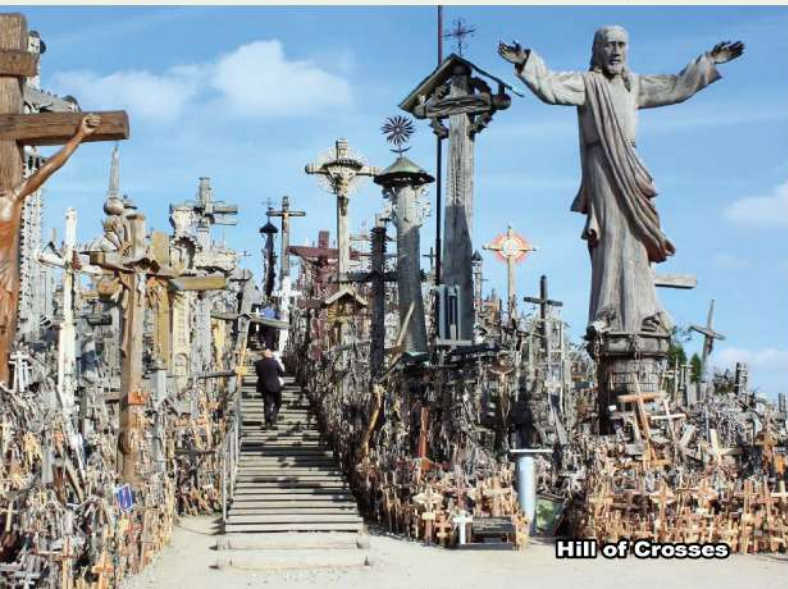
Hill of Crosses

Remark : There will be no refund or replacement if the tour logistic affected by the above issue. Picture are for illustration purpose only