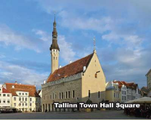
Tallinn Town Hall Square