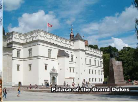
Palace of the Grand Dukes