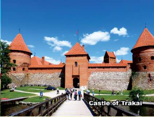
Castle of Trakai