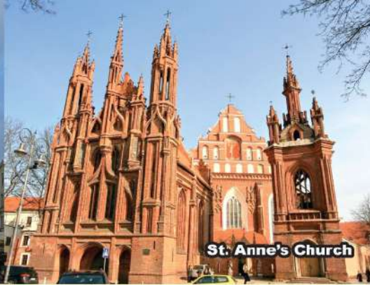
St. Anne's Church