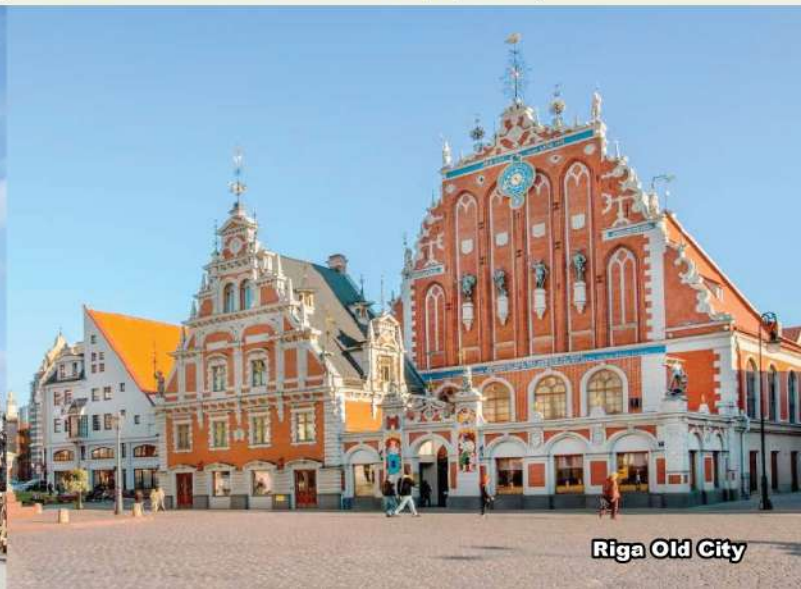
Riga Old City