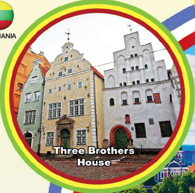
Three Brothers House