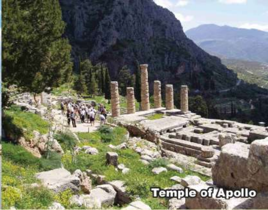
Temple of Apollo