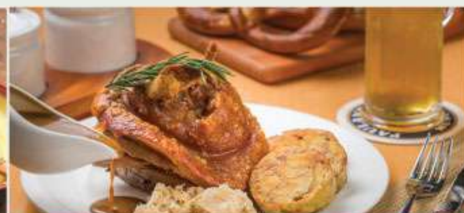
3 Course Meal –German Lunch with Pork Knuckle

Disclaimer : Due to local / religious festivals , public holidays , weather condition , transport technical issue , act of nature , Golden Destinations reserve the right to alter the sequence or change , amend or alter the itinerary if necessary , with or without prior notice.