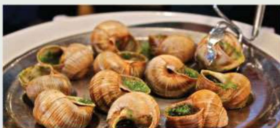
3 Course Meal –French Cuisine with Escargot