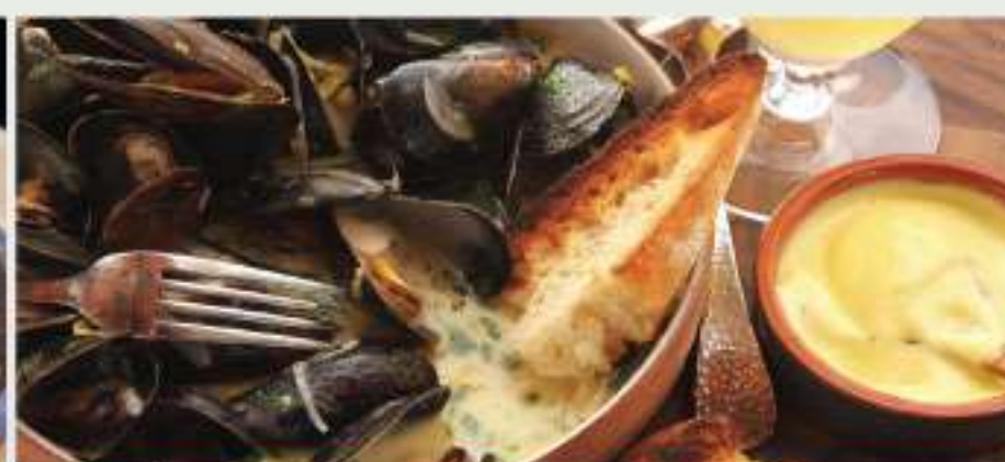
3 Course Meal –Mussels Meals