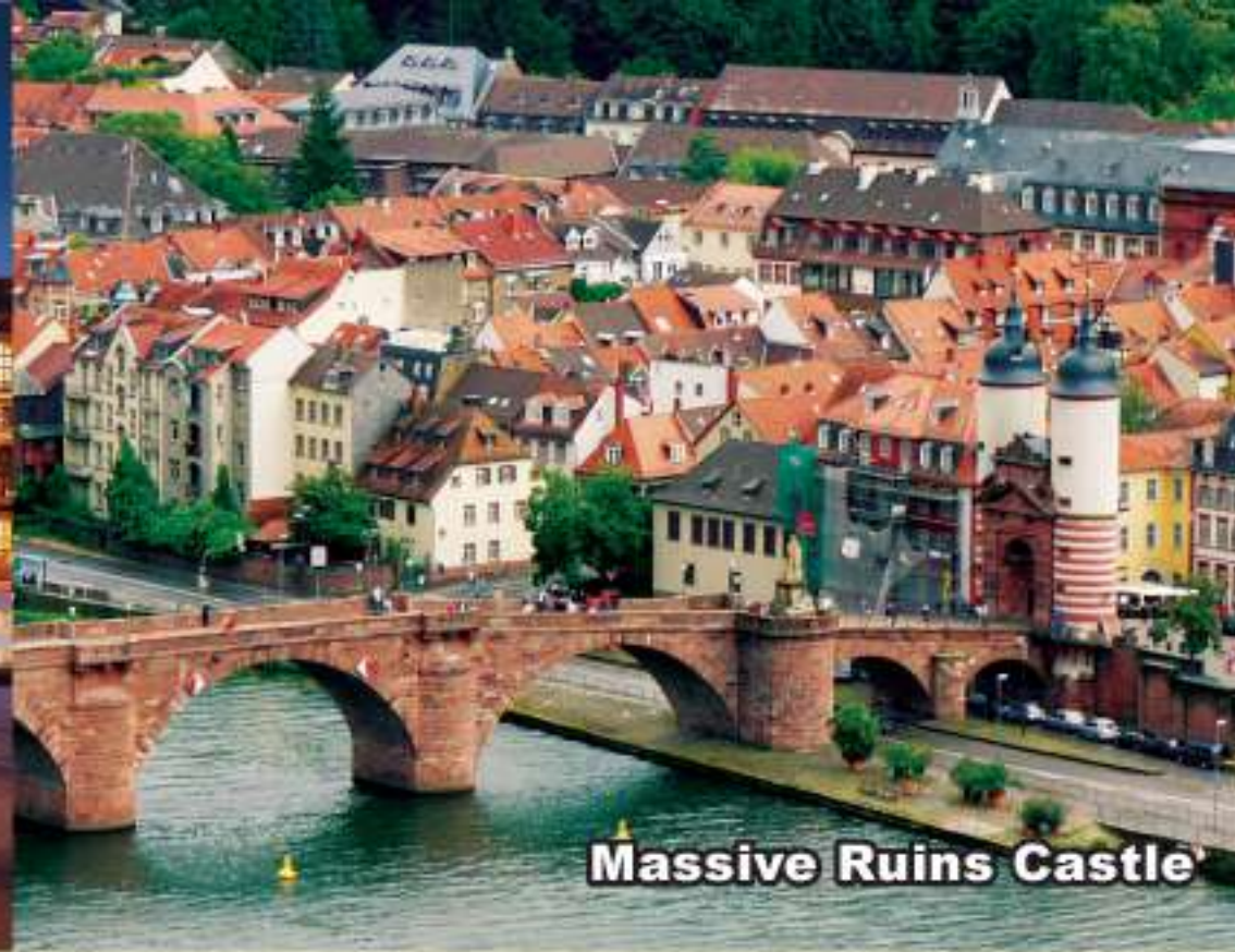
Massive Ruins Castle