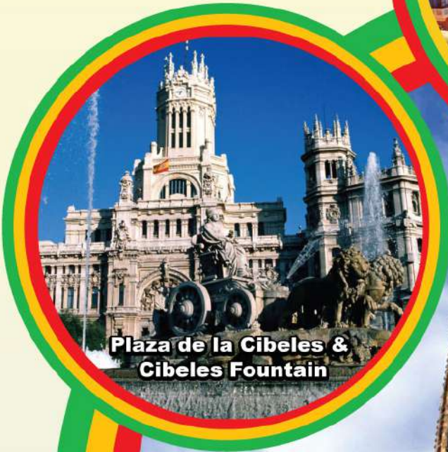
Plaza de la Cibeles & Cibeles Fountain