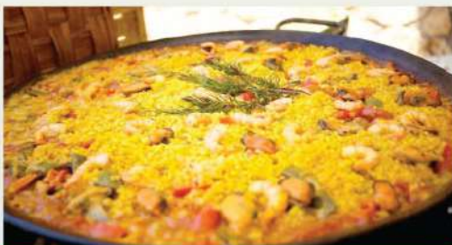
Traditional Spanish Paella

Disclaimer : Due to local / religious festivals , public holidays , weather condition , transport technical issue , act of nature , Golden Destinations reserve the right to alter the sequence or change , amend or alter the itinerary if necessary , with or without prior notice.