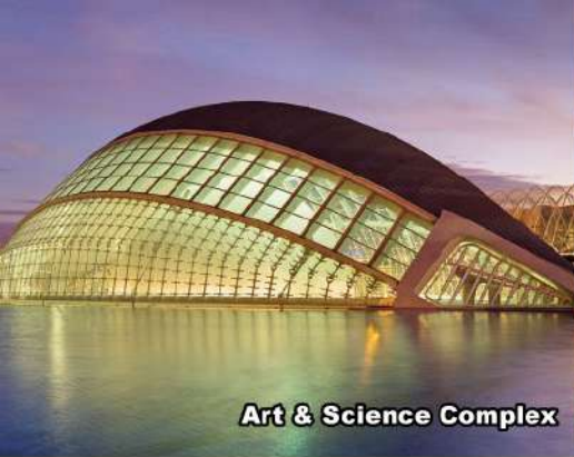
Art & Science Complex