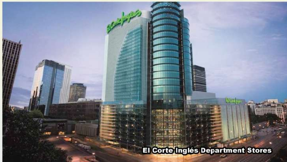
El Corte Inglés Department Stores