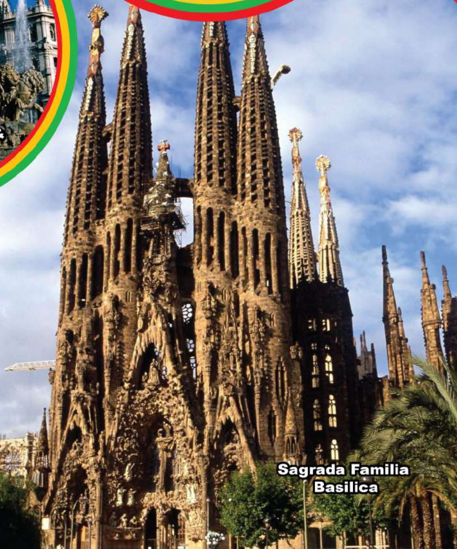
Sagrada Familia Basilica